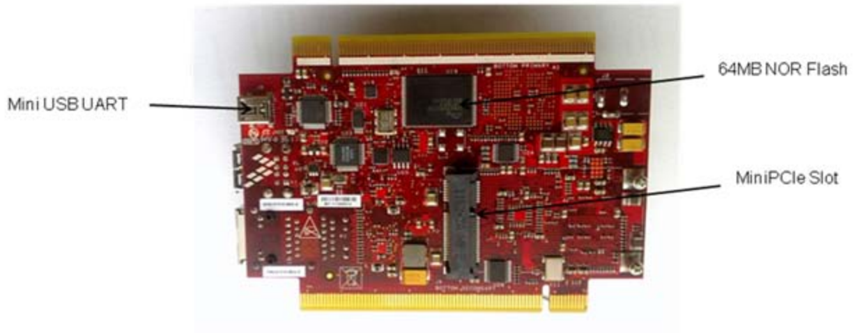
Figure 2-3: Secondary Side Main Features