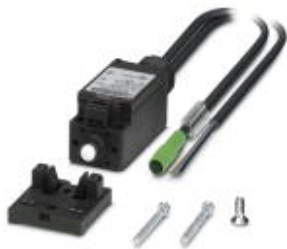
Door position switch with 3 m cable with open cable end and 0.6 m cable with M8 socket (Snap-in), including mounting accessories

Please be informed that the data shown in this PDF Document is generated from our Online Catalog. Please find the complete data in the user's documentation. Our General Terms of Use for Downloads are valid ( http://phoenixcontact.com/download )