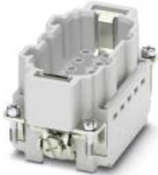
HEAVYCON pin insert, for 830 V (III/3), with 3 N/O contacts and 2 switch contacts, crimp connection

Please be informed that the data shown in this PDF Document is generated from our Online Catalog. Please find the complete data in the user's documentation. Our General Terms of Use for Downloads are valid ( http://phoenixcontact.com/download )