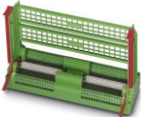
Plug-in card block, Pitch: 0 mm, Connection method: Screw connection, Contact surface: Tin

Please be informed that the data shown in this PDF Document is generated from our Online Catalog. Please find the complete data in the user's documentation. Our General Terms of Use for Downloads are valid ( http://phoenixcontact.com/download )