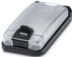
Mounting frame for one front plate/socket, frame: black, cover: transparent, closed with rotary knob.

Please be informed that the data shown in this PDF Document is generated from our Online Catalog. Please find the complete data in the user's documentation. Our General Terms of Use for Downloads are valid ( http://phoenixcontact.com/download )