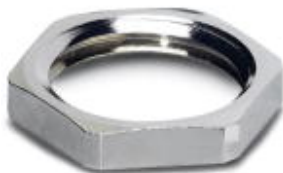
Flat nut with Pg9 thread

Please be informed that the data shown in this PDF Document is generated from our Online Catalog. Please find the complete data in the user's documentation. Our General Terms of Use for Downloads are valid ( http://download.phoenixcontact.com )